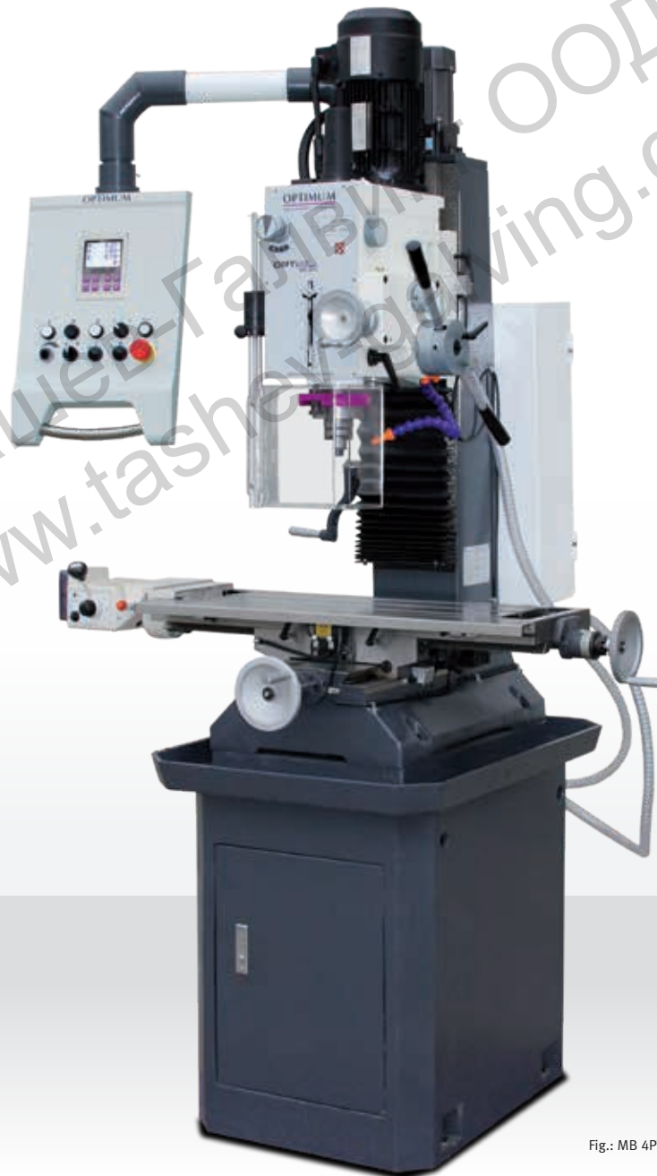
Fig.: MB 4PV